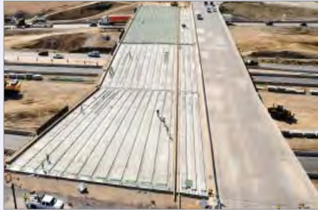
Fall 2011: Work on Main Street Bridge. The structure was substantially complete in December.

The initial DFW Connector project spans 8.4 miles in Grapevine, Southlake and Irving, and it doubles the size of the existing highway system around the north DFW Airport