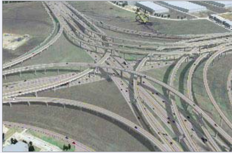
IH-35W / IH-820 interchange* *Conceptual presentation of ultimate interchange. Subject to change.

The North Tarrant Express (NTE) Master Development Plan (MDP) is a 10-year agreement between TxDOT and NTE Mobility Partners (NTEMP) to identify proposed improvements to portions of Interstate 35W (I-35W), State Highway 183 and I-820 in northern and eastern Tarrant County. The plan will lay out current and future needs and solutions for general purpose lanes and managed toll lanes, which will keep traffic moving at 50 mph. The $2.5 million agreement also will identify funding methods for the proposed improvements. If necessary, TxDOT has an option to extend the agreement for an additional five years.