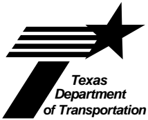
Exhibit A DEVELOPMENT AGREEMENT SITE INVESTIGATION ON HIGHWAY RIGHT OF WAY IN THE EL PASO DISTRICT

_____ is giving written notice of proposed Work to take place within the right of way of Loop 375 - Border Highway West Extension in El Paso County, TX as follows: