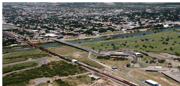
Eagle Pass Port-of-Entry (POE)

The Texas Department of Transportation (TxDOT), in collaboration and partnership with the Border Trade Advisory Committee (BTAC), is working with binational federal, state, regional, and private sector stakeholders to undertake development of the Texas-Mexico Border Transportation Master Plan (TX-MX BTMP). The TX-MX BTMP is a comprehensive multimodal and binational approach for identifying the cross-border challenges of moving people and goods. The TX-MX BTMP will develop potential transportation investment strategies that support binational, state, regional, and local economic competitiveness.