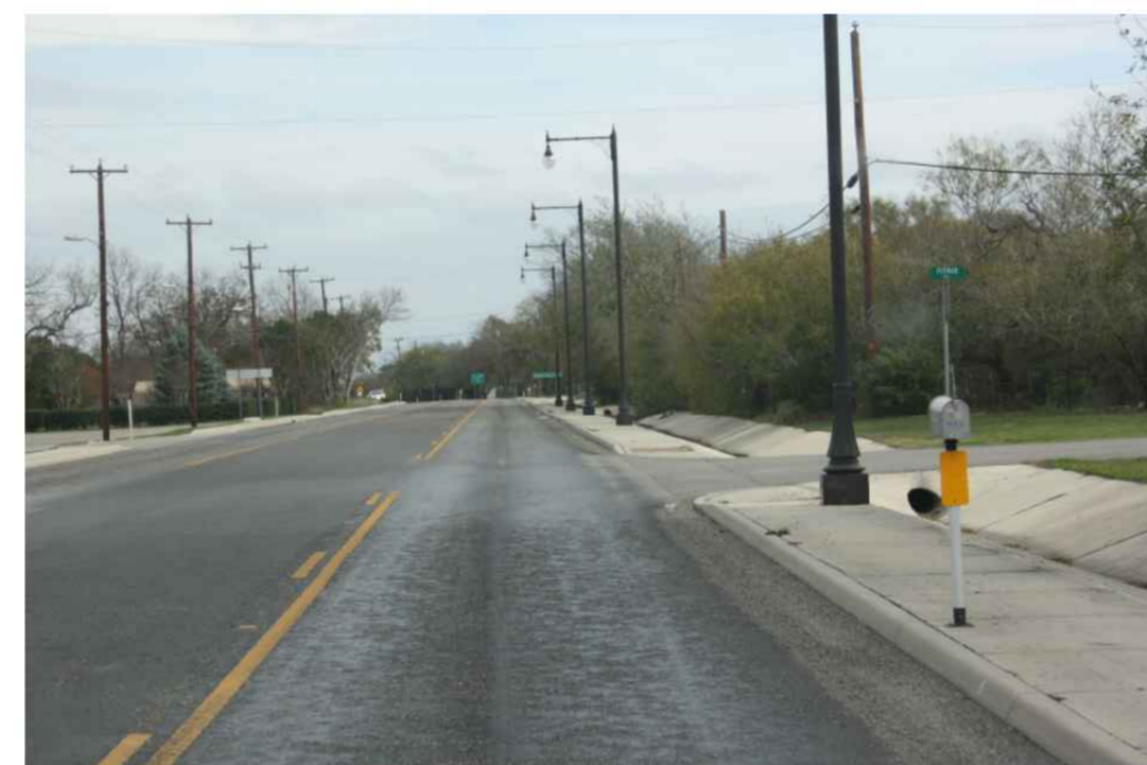
ADA COMPLIANT INTERSECTION