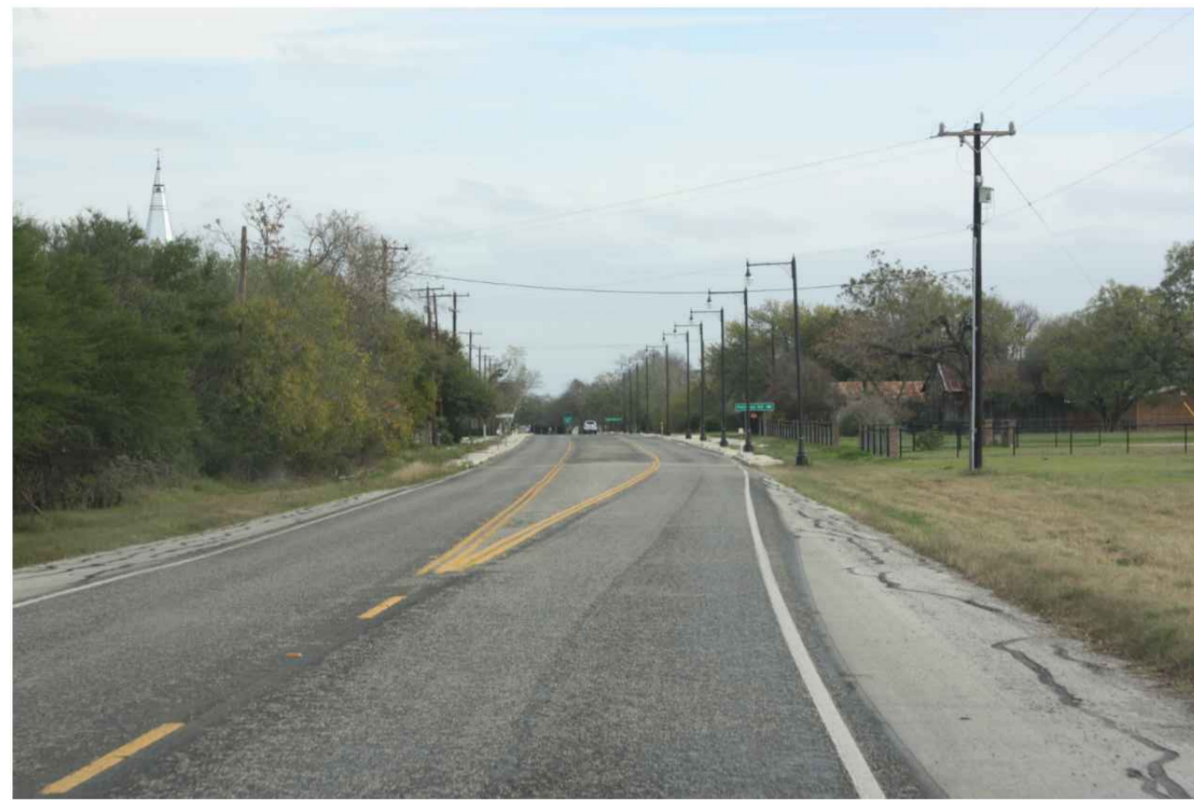
TRANSITION FROM RURAL TO URBAN

SIMILAR IMPROVEMENTS WERE MADE IN ST. HEDWIG, TX THAT ARE BEING PROPOSED ON FM 972 IN WALBURG. DESIGN ELEMENTS FROM THE FM 972 PROJECT ARE ILLUSTRATED IN THE PHOTOS.