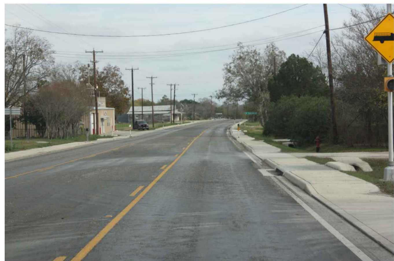
TYPICAL DRAIN INLET