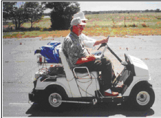
Figure 2 —Illustration of a Lightweight Inertial Profiler Developed by the Department