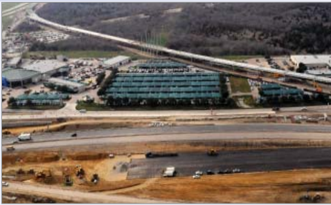
Feb. 2012: SH 114 (foreground) and new Wm. D. Tate direct ramp (top) located behind Classic Chevrolet.

The initial DFW Connector project spans 8.4 miles in Grapevine, Southlake and Irving, and it doubles the size of the existing highway system around the north DFW Airport