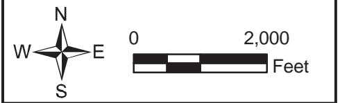
FIGURE 1 PROJECT LOCATION MAP US 377 CRESSON MOBILITY PROJECT CSJs: 0080-11-001 AND 0080-12-001