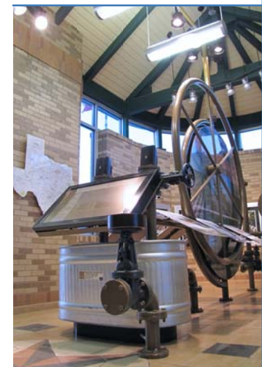
Interactive exhibit displays inside the Hale County facility (IH-27, north of Lubbock) feature a regional agricultural theme with local history & tourist attractions information