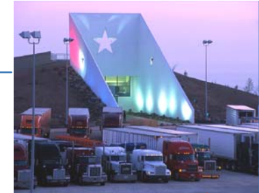
"Earth-Shelter" design of the Gray County (IH-40, east of Amarillo) facility emulates natural rock outcropping common in the area while conserving building thermal energy.

Although the Safety Rest Areas are designed to invite, inform and entertain, the basic objective is to see that travelers like you arrive safely at your distant destinations. As you continue on your way, visit us often. Take care. Be safe. And enjoy the adventure of driving across the Great State of Texas.