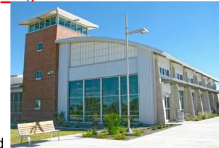
The Ward County facility (IH-20, west of Odessa) borrows architectural elements from a nearby abandoned military air base, with tall hanger concrete buttresses & barrel vaulted roofs