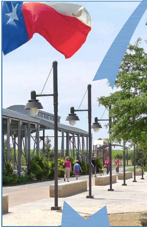
Donley County Safety Rest Area on US-287

Texas has 21 major highways that serve as long distance travel corridors. Along each of these roadways, rest areas are an essential safety feature to reduce accidents caused by driver fatigue. These facilities give travelers a break from driving, and then return them to the road rested, refreshed and alert.