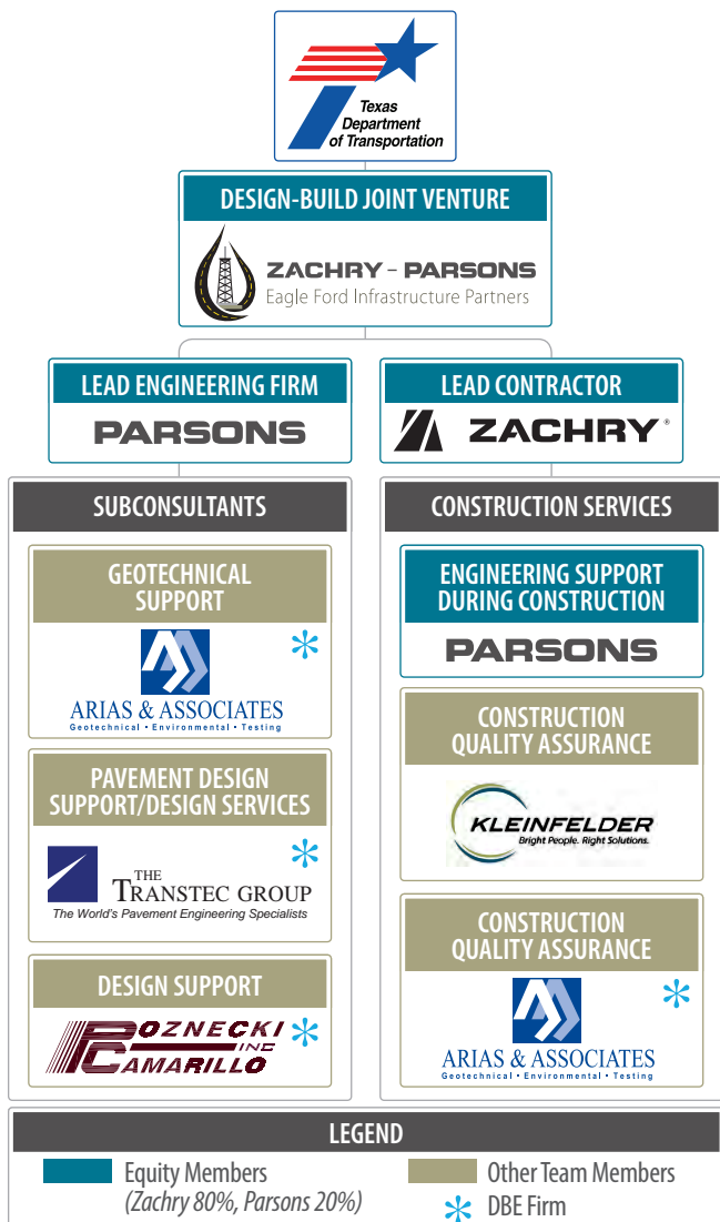
Exhibit A-2: Zachry-Parsons Team Organization

Equity members and major participants remain intact and engaged from those identified within the original qualifications statement (QS). No changes to key personnel have been made. However, due to Parsons Transportation Group, Inc's prequalification with TxDOT, the Guarantor, Parsons Corporation, is not necessary.