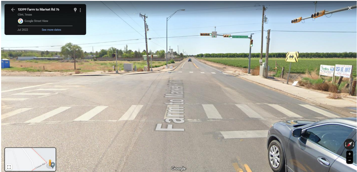
Figure 1: Intersection of FM 76 (North Loop Dr) with Clint-San Elizario.