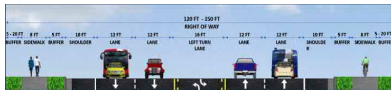
Proposed Roadway Typical Section