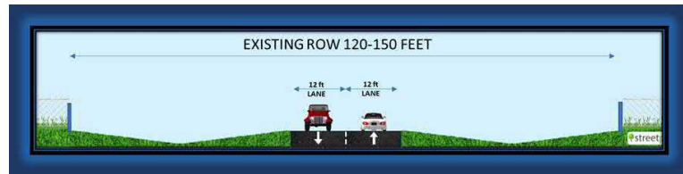
Existing Roadway Typical Section

Estimated Construction Start Date: Fiscal Year 2025