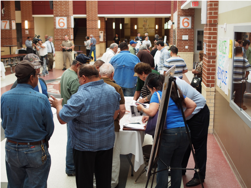
Public Scoping Meeting, March 15, 2016.

A lack of sufficient north/south mobility for local and regional traffic and for additional emergency evacuation routes, which are the result of historical and continuing growth in the region's population as well as continued growth of traffic in the region.